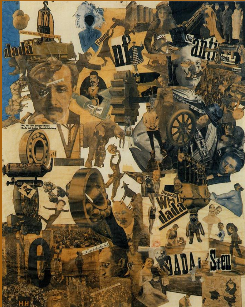
A Collage by Hannah Höch